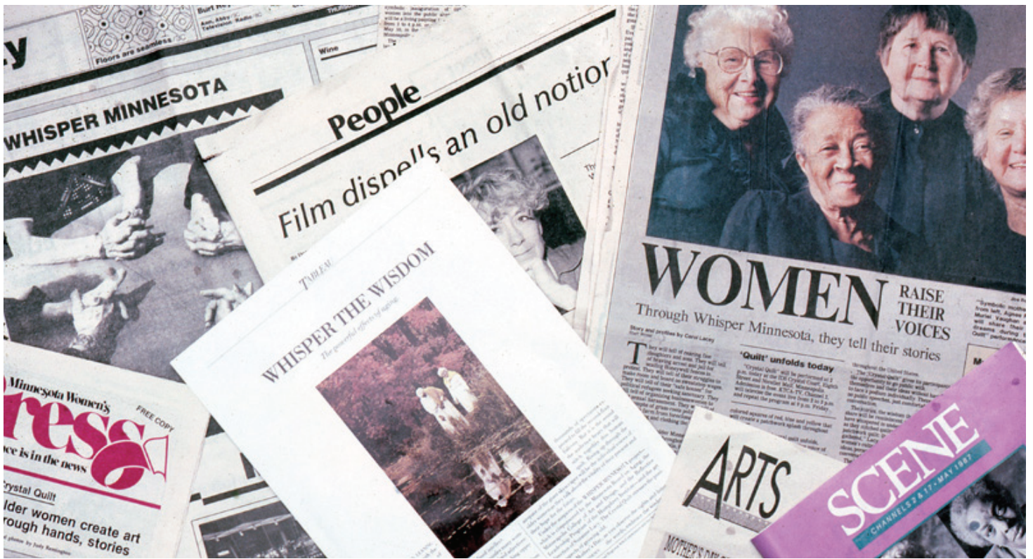
News Post-The Crystal Quilt, 1987

Participatory Action, Sunday 3 February 2013 Tate Modern, London