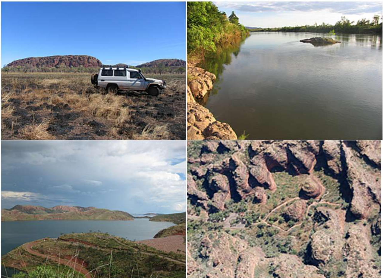
The natural beauty of the East Kimberley region