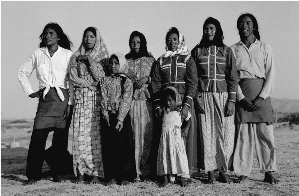
Figure 1.4 A group of Seri people in what outsiders call the “desert,” but which they call heheán (“place of the plants”)

iizax (“moon of the eelgrass harvest”), and the onset of harvest time is signaled when the black brant bird known as xnois cacáaso (“the foreteller of eelgrass seed”) dives into the sea to feed on the plant.