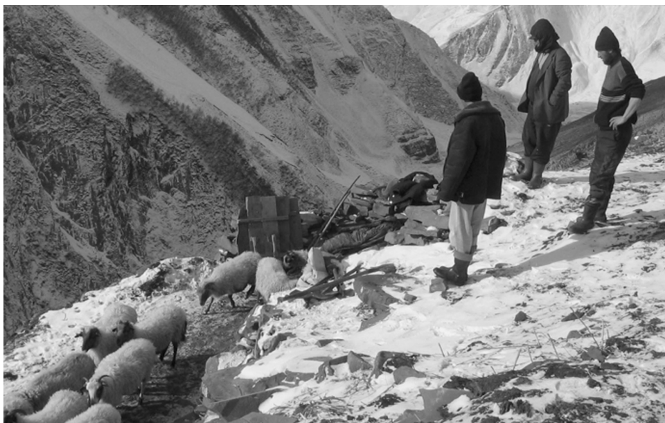
Figure 1.3 Archi men herding sheep into a matti or underground sheep fold

of Vanuatu (total population 195,000), most of whose population are village agriculturalists, counts 105 languages – an average of less than 2,000 speakers per language for the whole country! Apart from the recently developed national lingua franca, Bislama, its biggest language (Lenakel) has just 11,500 speakers and only 13 languages have 5,000 speakers or more. 6