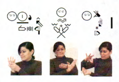
La mariposa vuela a la flor.

Read the facial features signs left to right. The blue eye gaze (with an appropriate head tilt) follows the moving figure classifier (also in blue). The signer's eye gaze (and head tilt) change to track the collision of the vehicle classifier with the stationary classifier clitic.