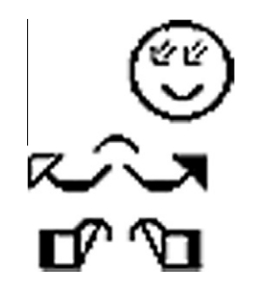
Fig. 2. (PAPA BEAR)-OPENS-THE-NEWSPAPER.

However, the fact that SW does not presuppose which elements of signed performance should be encoded in writing creates space for individual writers to make their own analyses of the sign languages they write. Valerie Sutton has encouraged those using SW to "write what they see" and signers sometimes see things differently than linguists might. In particular, as we will see below, many SW writers do in fact choose to encode not only widely accepted non-manual grammatical markers, but also aspects of signing practice that most linguists would deem paralinguistic.